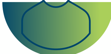
Vacant | STAR Coordinator