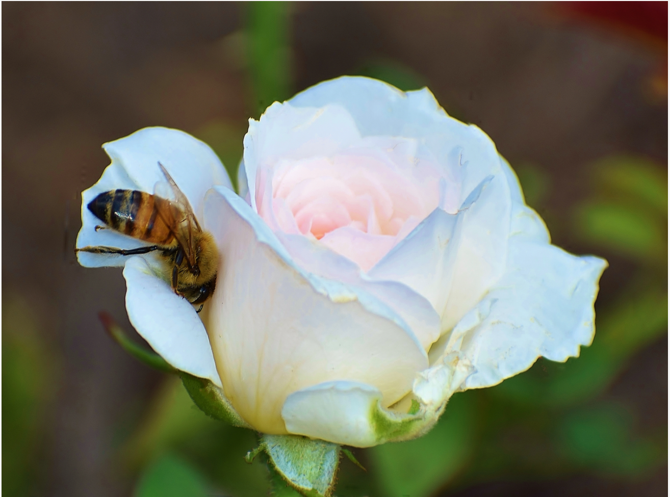
ABOVE: A WINNING ADULT PHOTO BY SONDRA COOPER