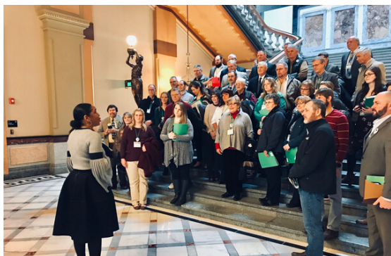
ABOVE: Lt. Governor Stratton speaks to AISWCD lobby day attendees in the rotunda.