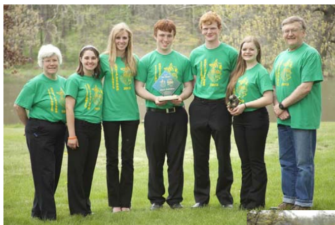
First Place Team Triad High School, Troy, IL

Madison County Soil and Water Conservation District