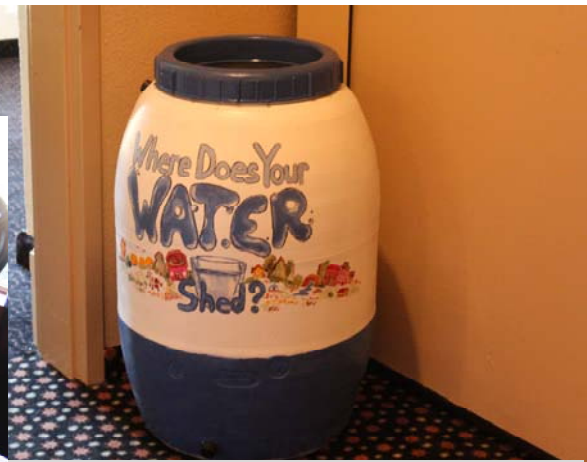
What a great looking rain barrel!

AISWCD Mission: To represent and empower Illinois' SWCDs