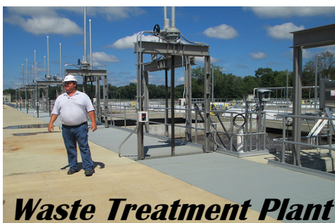
Waste Treatment Plant