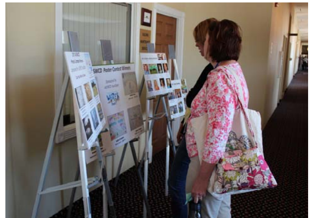
Viewing winning photos and posters.

I really enjoyed my first Annual Meeting and Summer Conference. It takes a lot of work but it was certainly worth it to see all of the people having a good time and I was happy to be able to meet many of you that I have talked to over the phone, face-to-face. Much of the work I did leading up to the event was with the program booklet, signs for sessions, and poster and photo winners, registration and award winner certificates. I also ordered the Who Buddies teaching materials and put it in packets for the SWCDs to pick up. Those who were not in attendance or did not pick up their materials will be able to get them at Winter Training.