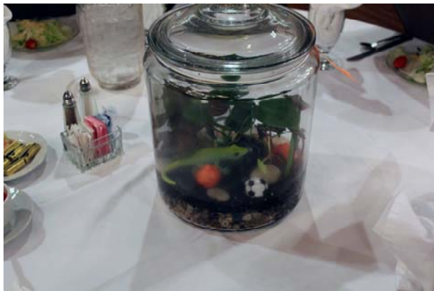
One of the many great terrariums donated by the SWCD as table decorations and later sold.