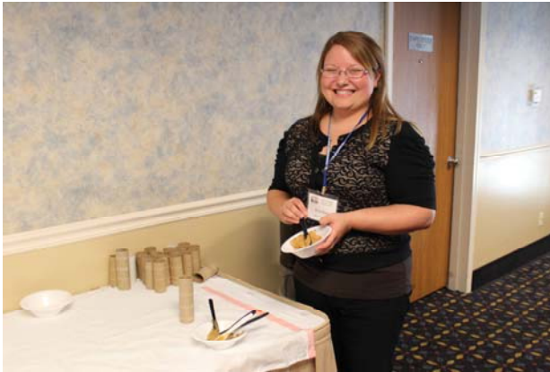
Making bird feeders out of paper tubes, peanut butter and bird seed.

I really enjoyed my first Annual Meeting and Summer Conference. It takes a lot of work but it was certainly worth it to see all of the people having a good time and I was happy to be able to meet many of you that I have talked to over the phone, face-to-face. Much of the work I did leading up to the event was with the program booklet, signs for sessions, and poster and photo winners, registration and award winner certificates. I also ordered the Who Buddies teaching materials and put it in packets for the SWCDs to pick up. Those who were not in attendance or did not pick up their materials will be able to get them at Winter Training.