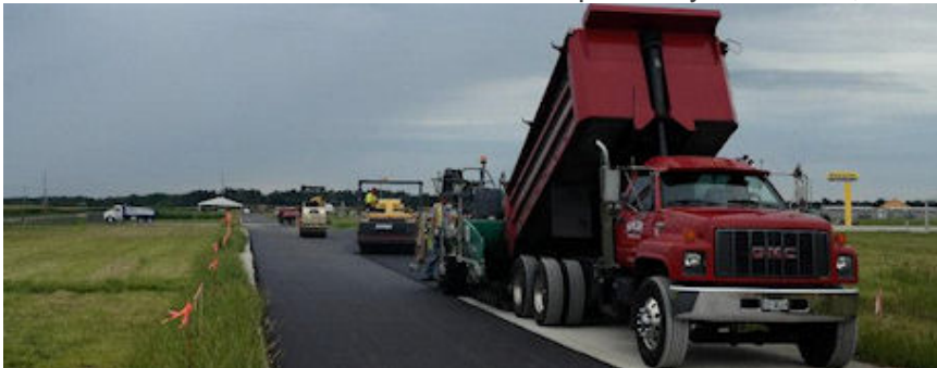
The completion of 12th Street for the Farm Progress Show, August 27, 28 and 29 in Decatur, Illinois.