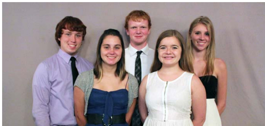
2013 Illinois Envirothon Winners, Triad High School, Troy, IL Madison County SWCD