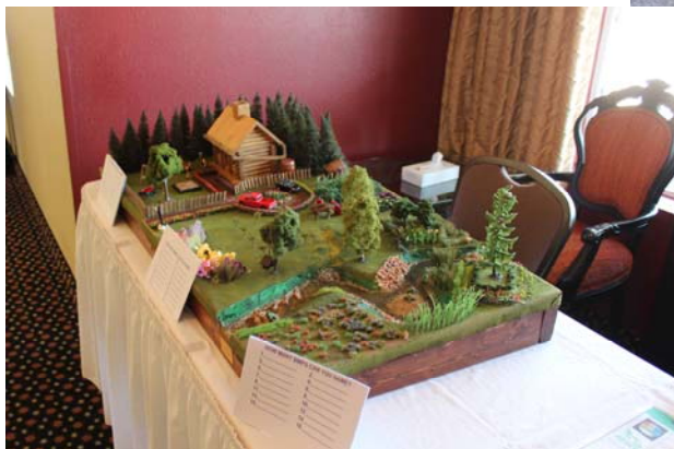
How many conservation practices did you find?