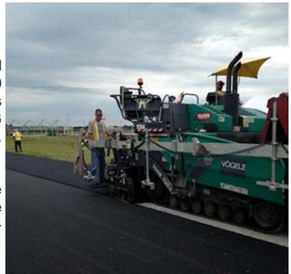
Finishing the final street at Progress City in Decatur.

This year's show has even more for visitors to see. With the completion of Twelfth Progress Street and the addition of the Annex, the Farm Progress Show will host more than 600 companies, almost 100 more exhibitors than in previous years.