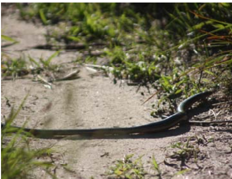
Ophisaurus attenuatus - the only legless lizard. Commonly called glass snakes, they are really lizards. Rare - at Ryan Wetland.

The change of seasons reminds us that change is inevitable. If we had been living here in Lee County, Illinois 10,000 years ago, the last glaciers would have been receding from our landscape and possibly a stag moose or two could still be found browsing the native ferns and sedges.