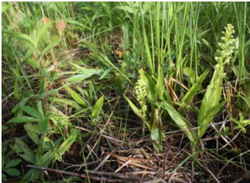
Tubercled orchid - Platanthera flava

Floral and faunal inventories are ongoing in all seasons. Species are documented in writing, by photography and with a plant press. Every year something new is discovered. This past spring it was nesting hooded mergansers. In 2010, in a neglected corner of the preserve, northern tubercled orchid was uncovered in the mowing of a blackberry patch. In June of the present year the full extent of the colony was revealed: over 200 plants hiding among sedges and ferns. Only a few weeks ago 3-way sedge was first noticed in one of the wetlands.