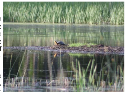
Adult Blanding's turtle at Ryan Wetland

The succession to forest was well under way but by no means complete, as evidenced by clearings still rich in prairie species. In these locations, and wherever trees and brush had not yet canopied, long absence of fire was the primary threat. Yet with all its problems, the potential of the new preserve was obvious.