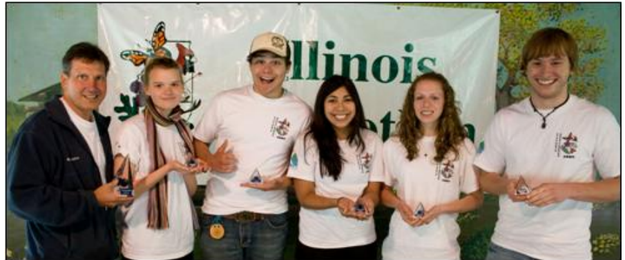
2009 WINNING TEAM - Woodstock High School, LUC 16 - McHenry Co.

The annual Illinois Envirothon Competition is underway at locations throughout Illinois. Illinois began participating in the Envirothon in 1995 with just one county, Coles. Today more than three-fourths of the SWCDs participate in local and Land Use Council (LUC) competitions.