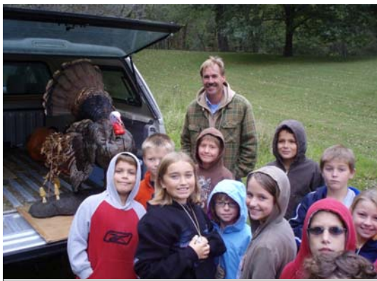
Students learned about the habits of wild turkeys at one of the many stations at the Conservation Day event.

This event supplements the schools' curriculum content by adding natural resource conservation and environmental activities to ensure and expand these topics. A variety of topics were provided by staff from the Illinois Dept. of Natural Resources, University of Illinois Extension, Soil & Water Conservation Districts, as well as several local volunteer experts. Topics covered areas such as: soil and water quality, animals found in the habitats of Illinois, forestry knowledge, fisheries topics, & backpacking. Hands-on activities & visual aids - along with the outdoor setting - increased the awareness and enthusiasm of the students participating.